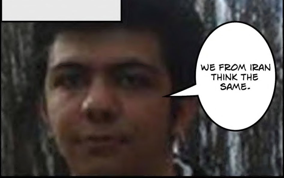
MEANWHILE AT IRAN---

I WAS THINKING ABOUT THE DOING THE SAME.